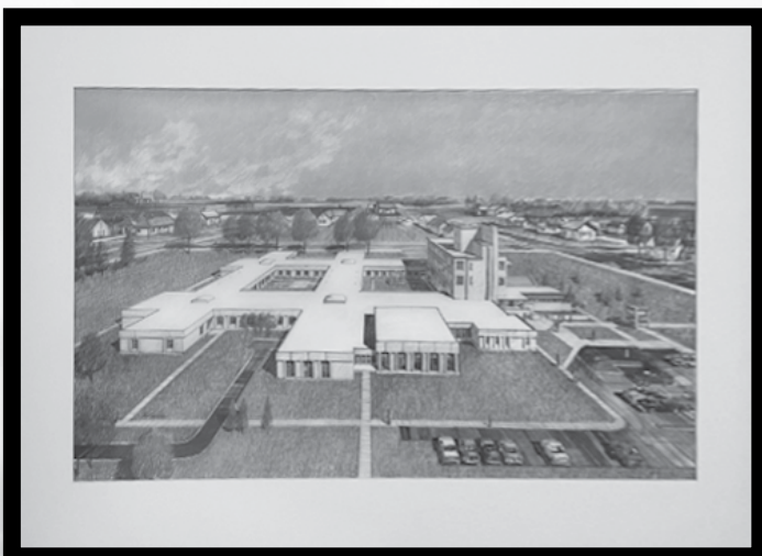
Architectural rendering from 1967 of a future addition to Bethel's original (1948) four story building.