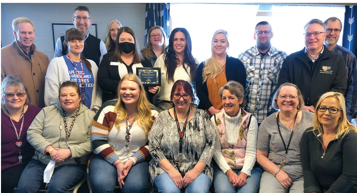
The Eckert staff was presented with the Leadership Award from the Williston Chamber of Commerce.