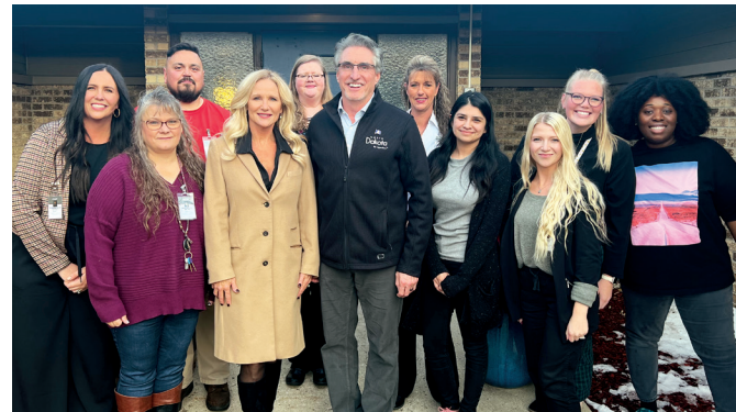
Governor Burgum and First Lady Kathryn Burgum with Eckert staff.

personally have learned a lot here and has helped me.