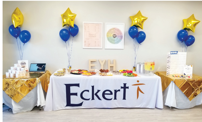
Outpatient office ribbon cutting open house.

The goal of opening an outpatient office was to provide the community with an additional resource for adolescents. Our outpatient office has hosted a few community workshops that are open to the public to learn more about substance abuse with adolescents. Our licensed addiction counselor has frequently visited Williston High School to provide educational seminars to student classes about substance abuse in addition to meeting with youth on campus one day a week. Another part of our goal was to reach out to the surrounding community. Thanks to the behavioral health grant, we were able to obtain office space, one day per week, in Ray to see youth from surrounding communities. Our LAC travels to Ray one day per week and has also spent time at both Ray and