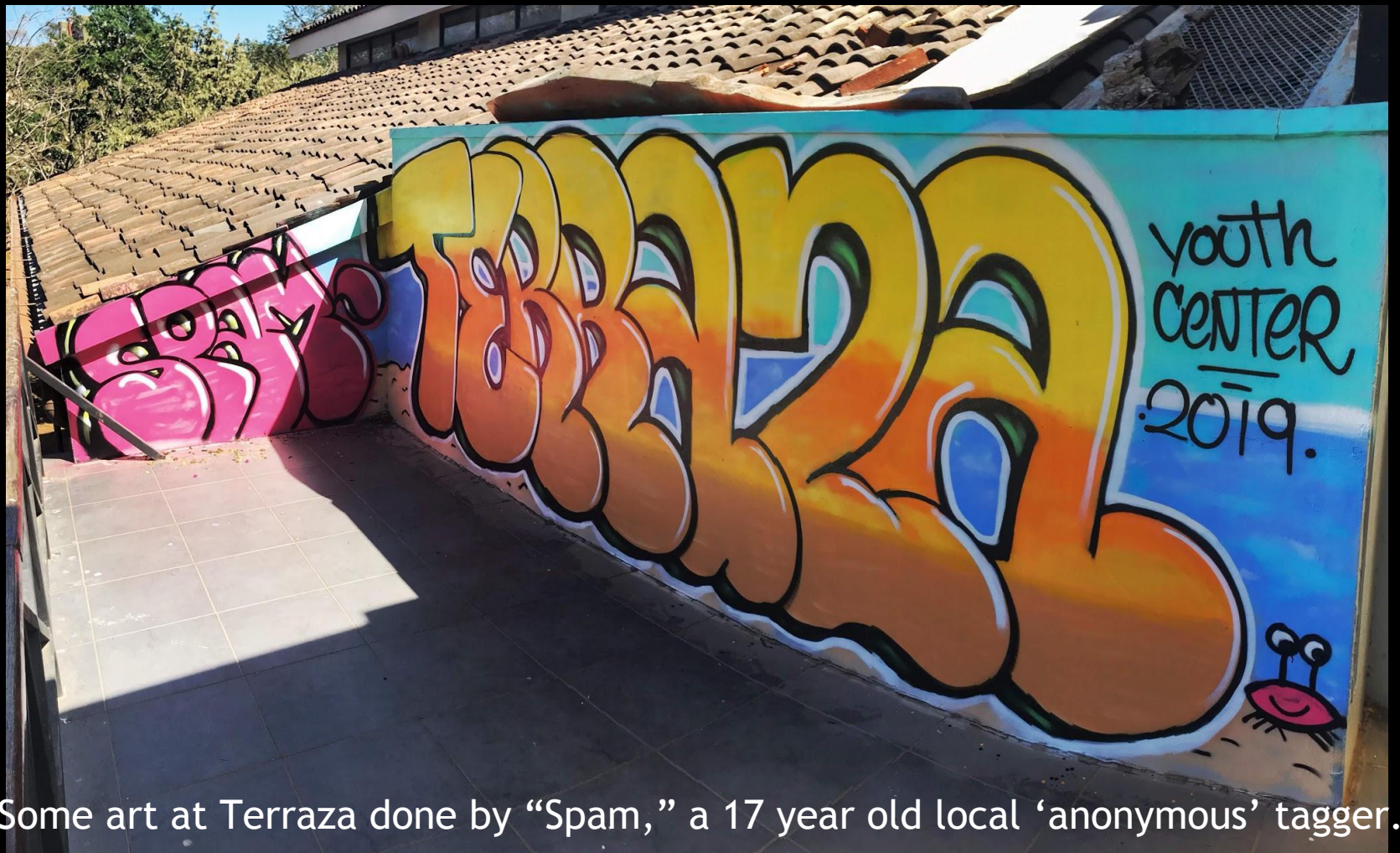
Some art at Terraza done by “Spam,” a 17 year old local ‘anonymous’ tagger.