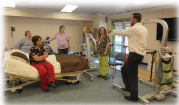
Staff received training on operating new lifts