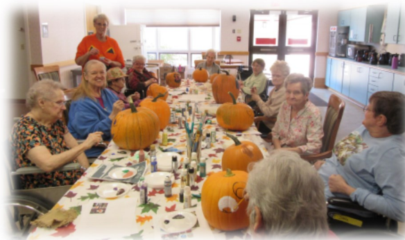
Residents and Staff painting pumpkins

Fall is a time for pumpkins and creativity. Residents and staff showed off their creative skills by painting and decorating pumpkins. The pumpkins all had unique themes and everyone enjoyed the afternoon!