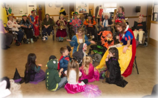
Residents and preschool class listening to a story