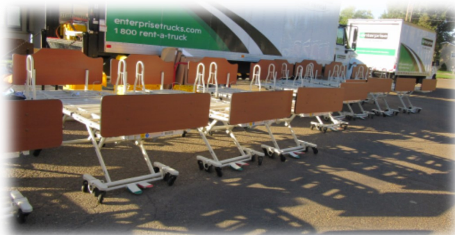
Assembly line of new bed frames