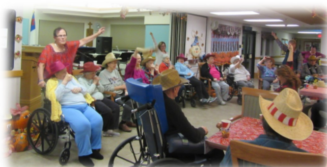
Residents and Staff performing a line dance