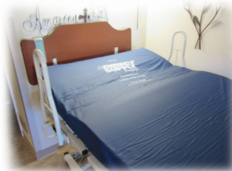
New bed and mattress

In addition, we have replaced all of the lifts utilized in the facility to brand new options that will make it easier and safer for all involved. A total of 7 were purchased allowing for each wing to have the type and amount of lifts needed to safely transfer residents accordingly.