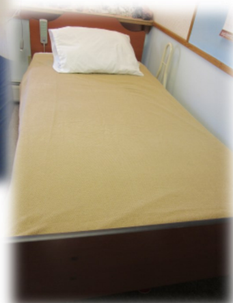
New linens on a new bed and mattress