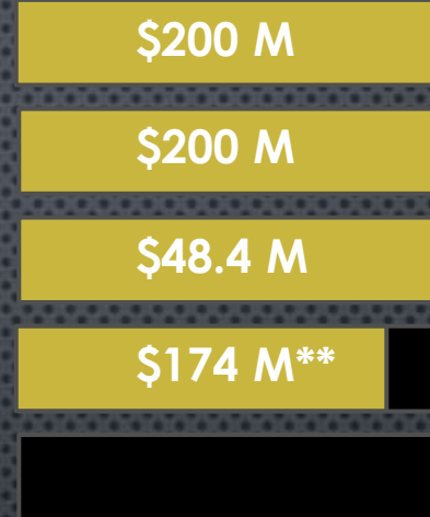
Oil Revenue for "The Buckets"